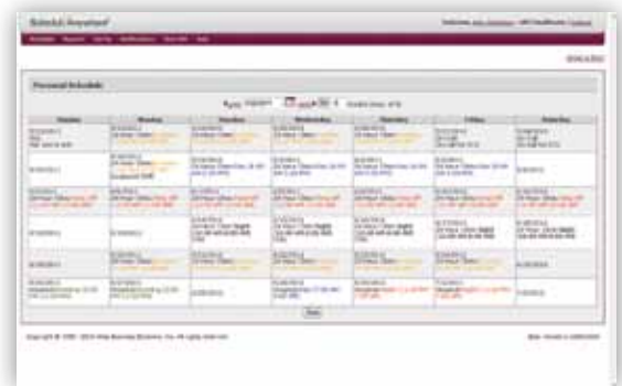
Weekly Personal Schedule View